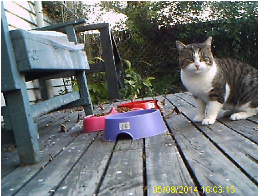
River Road near Medbury corner: Cat RR 1