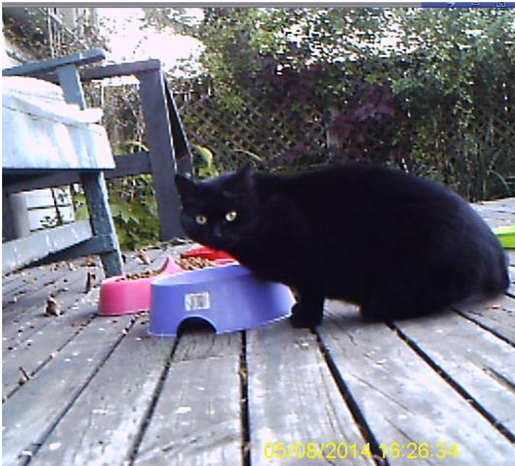
River Road near Medbury corner:

Tabby & white, has nuts, been at station since spring 2013. Has matured noticeably since then. Rarely observed except on camera .